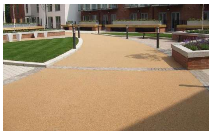
Fig 10- Resin bound gravel