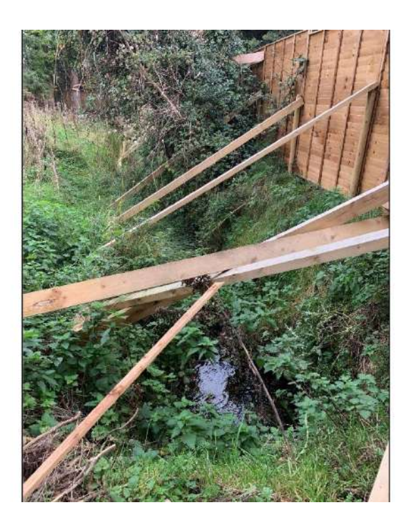
Figure 4 – Existing Carysfort Stream