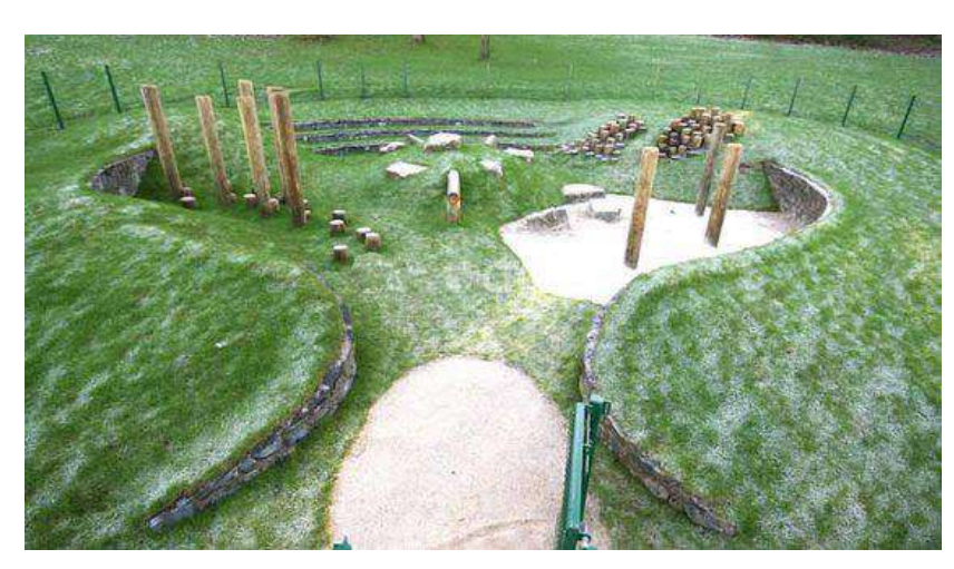
Fig 6 - Precedent image for Natural Play area ('Ringfort' play space, Lucan by Playscapes)