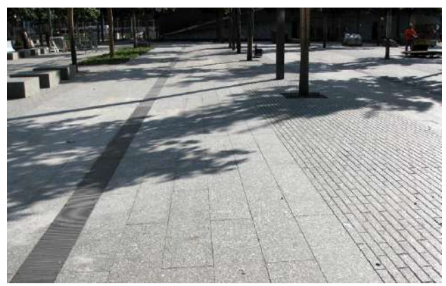
Fig 12 -Stone Paving, Silver Granite Slabs, Flamed finish