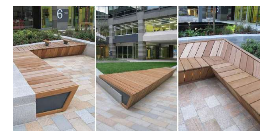
Fig 11 - Hardwood and steel street furniture design typologies