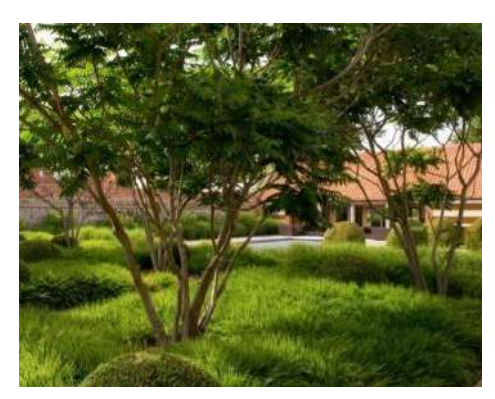
Figure 7 - Sample planting images