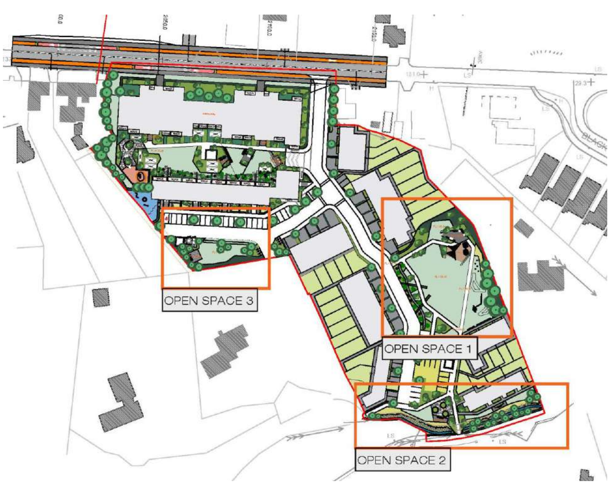
Fig. 1 - Landscape Masterplan

The landscape strategy aims to integrate the new built development with the existing landscape and create a network of attractive and usable open spaces while contributing to local biodiversity. The character of the landscape proposed is one of native woodland, wildflower meadow, ornamental trees and tree copses with structure shrub planting, formal clipped hedges, grass swales and large open lawn areas. The public green areas are designed as landscape spaces that offer the opportunity for meeting, walking and formal and informal play.